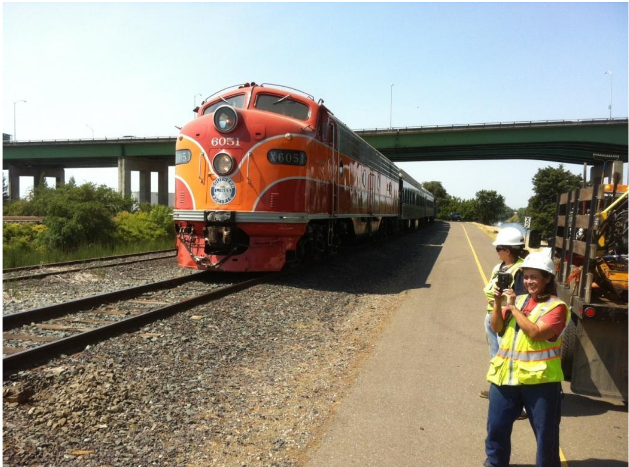
Pam and Heather enjoying the view of SP 6051 passing through our work limits.