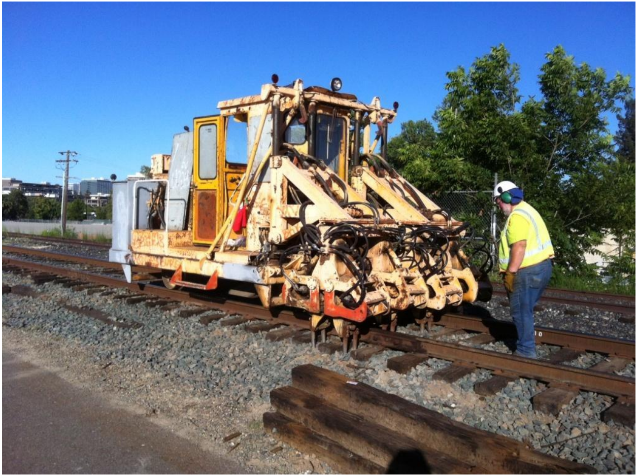
With Heather in the cab, Frank guides the action from the ground.