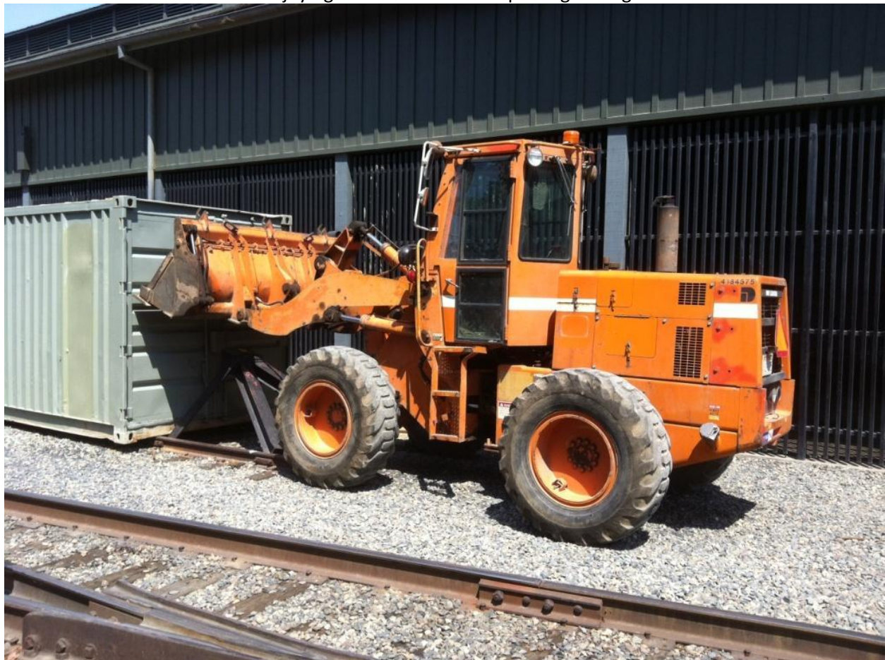
Our trusty front-end loader being used to hold the north doors of the container closed.